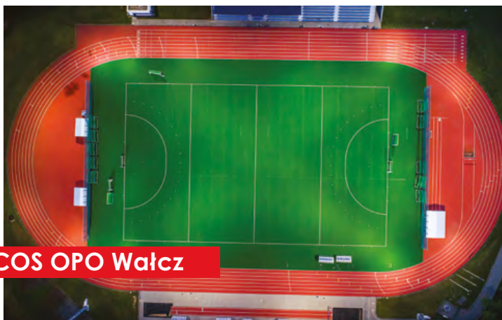
COS OPO Wałcz