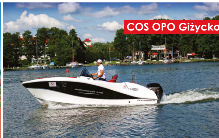
COS OPO Giżycko