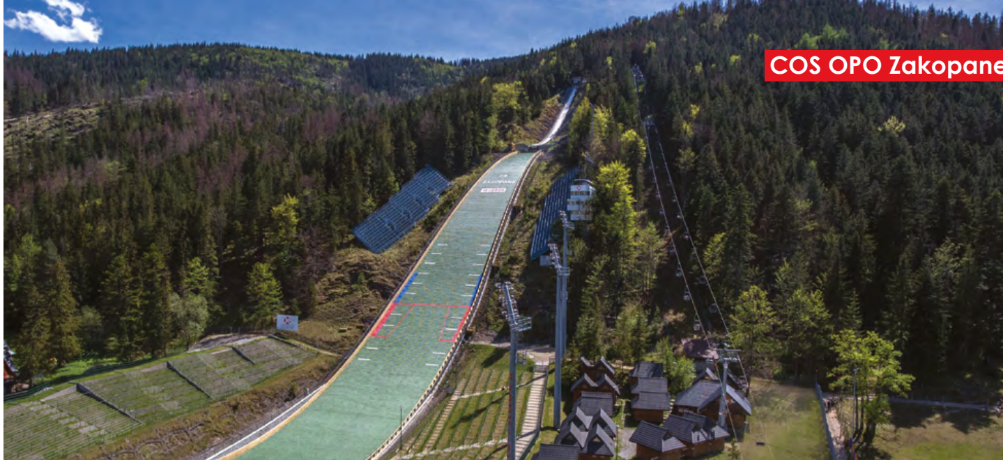
COS OPO Zakopane