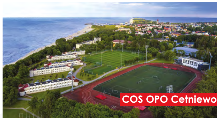
COS OPO Cetniewo