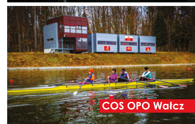
COS OPO Wałcz