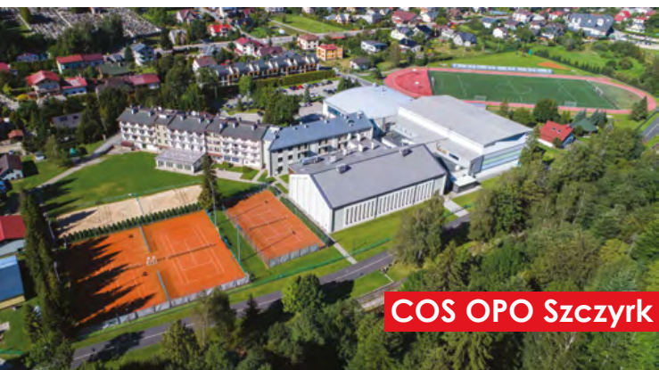
COS OPO Szczyrk