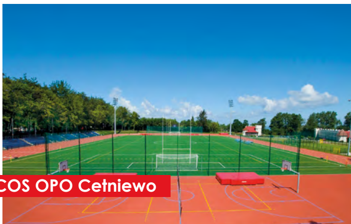
COS OPO Cetniewo