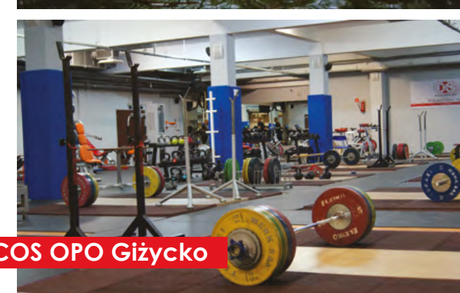
COS OPO Giżycko