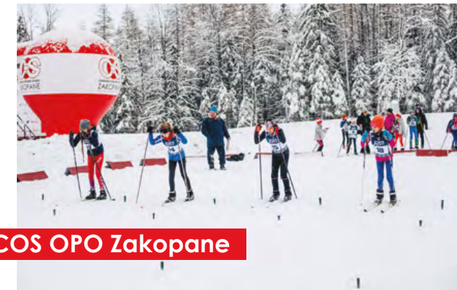
COS OPO Zakopane