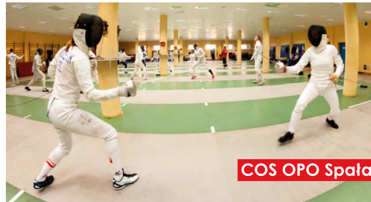
COS OPO Spała

The Central Sports Center was established to create the best conditions for the development of Polish sports. By continuously modernizing the sports infrastructure for training national and Olympic teams, it significantly influences the achievement of the best sports results. The focus of COS is mainly on providing the right conditions for training athletes in the extensive sports base of the Olympic preparation centers. In COS OPO, players are participating in training camps of Polish national teams, preparing for the Olympic Games, Paralympic Games, European and World Championships.